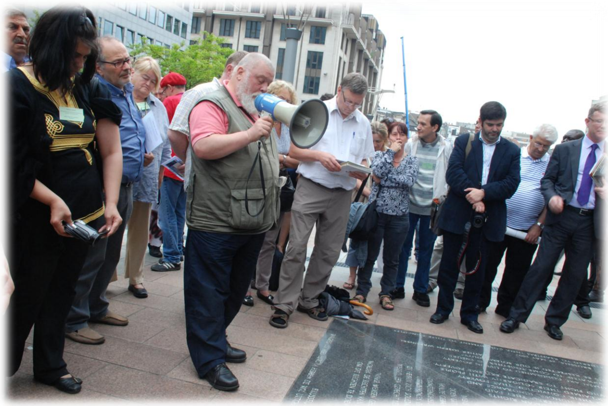
Gathering at the Commemorative stone for the victims of poverty on the Esplanade in front of the European Parliament.

We hope that all who look at this publication will find energy to remain active in the fight against poverty, exclusion and inequalities and the generosity of vision to fight for a good life for everybody.