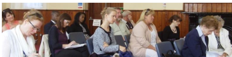
Picture: Participants at AGM 2012