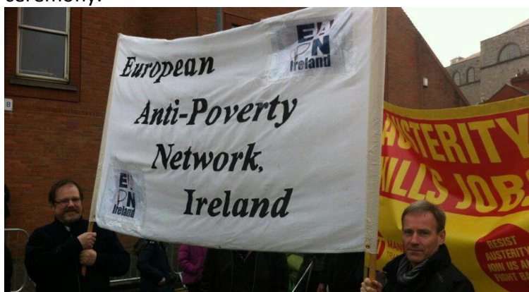
Picture: EAPN Ireland banner at an ICTU demonstration

Other policy work included a presentation to Monaghan Integrated Development at their Community Awards ceremony.