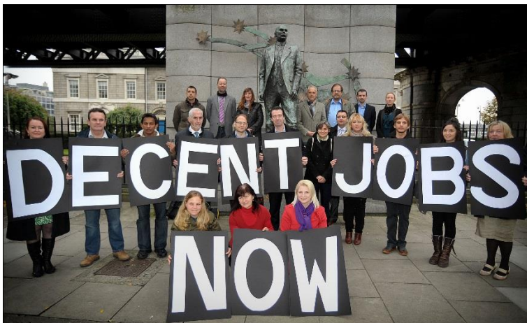
Picture: A photo shoot for the Coalition to Protect the low paid – one of the alliances which EAPN Ireland takes part in.

In addition in this period EAPN Ireland, staff volunteers and members participated in a wide range of events and activities.