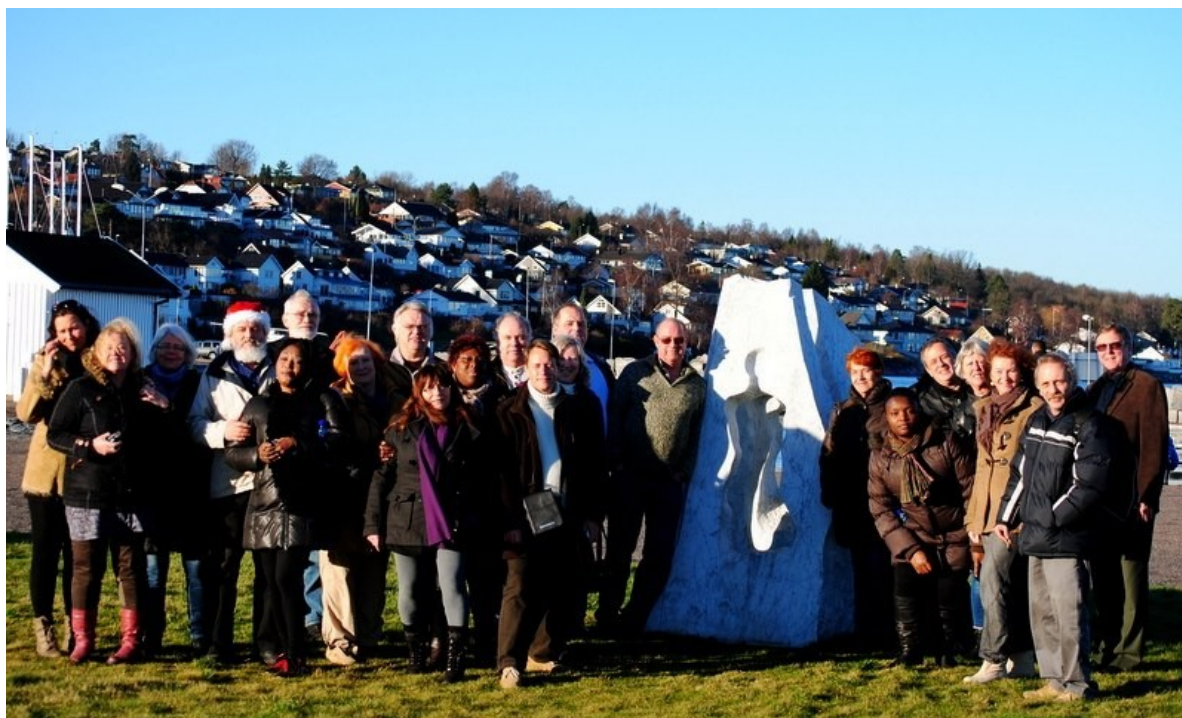
Participants at the November membership meeting.