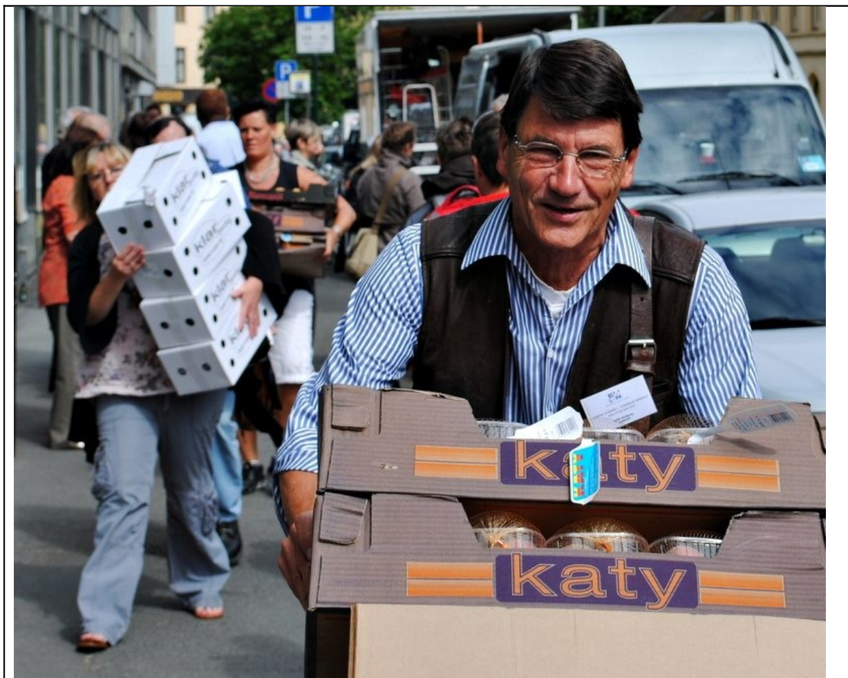
EAPN delegate visits and assists Oslo Poor House ©

Outcome: All unresolved cases that have not found their solution at the General Assembly in Lisbon last year were resolved in Sandvika.