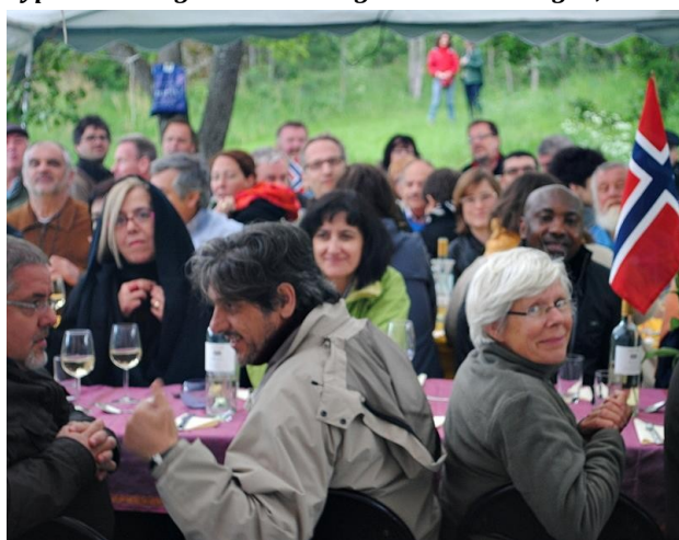
The Icelanders were freezing most ☺