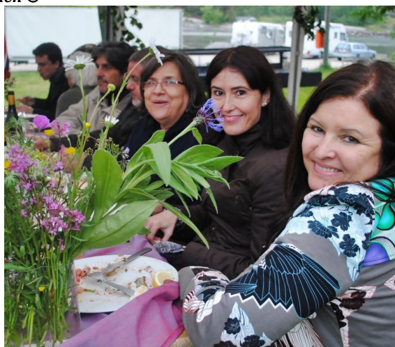
....while the girls from Spain heated up the place with their smiles!