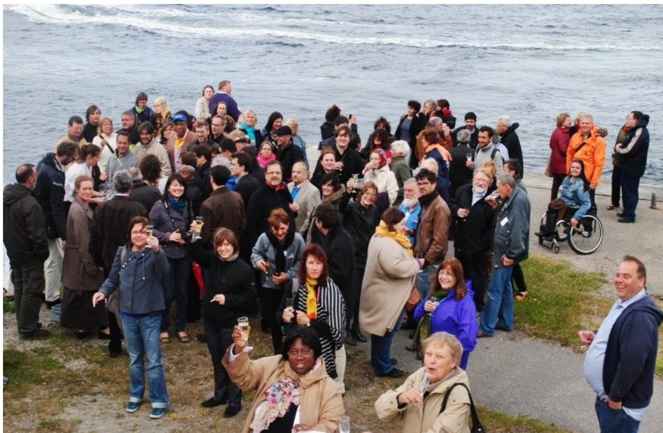
Guest from Europe, at the final party at Nesodden