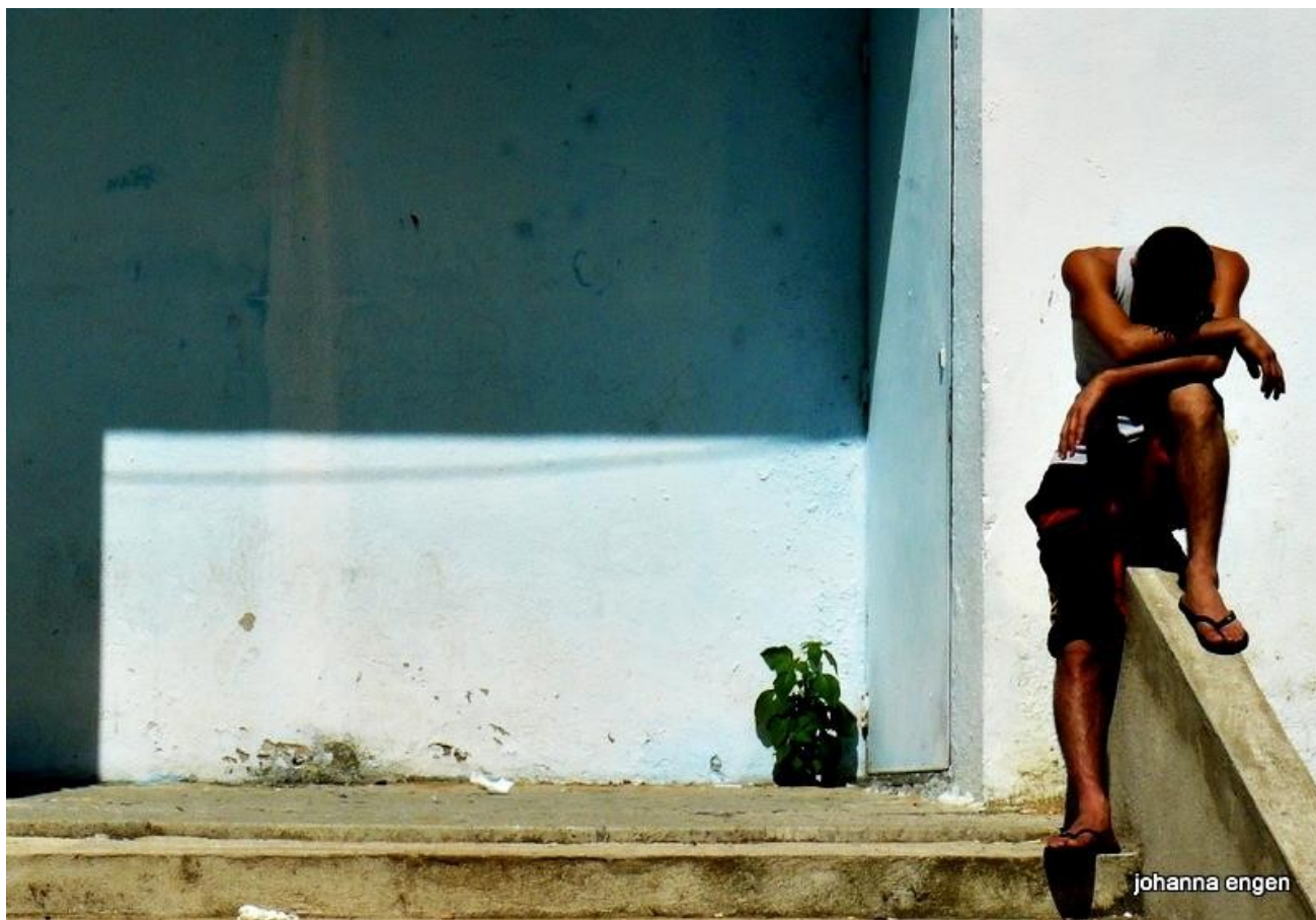
The financial crisis in EU...

Nordic Welfare Platform: There has not been arranged any meetings in 2012 in this network www.nordicplatform.org .