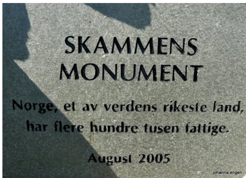
Monument of Shame placed by the network on Norway's national mountain at Dovre, Norway, "one of the richest countries in the world have several hundred thousand people facing poverty, August 2005."