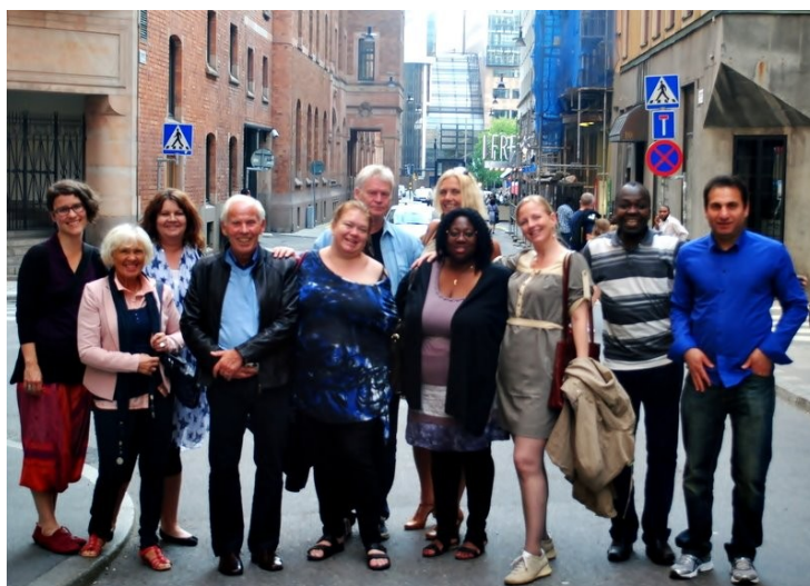
Cooperation Forums study visit to Stockholm, Sweden summer 2012, Social Work Social Development

There have been arranged 6 meetings in the Cooperation Forum in 2012 and 2 meetings with the Ministry in the Liaison Committee for Economic and socially disadvantaged