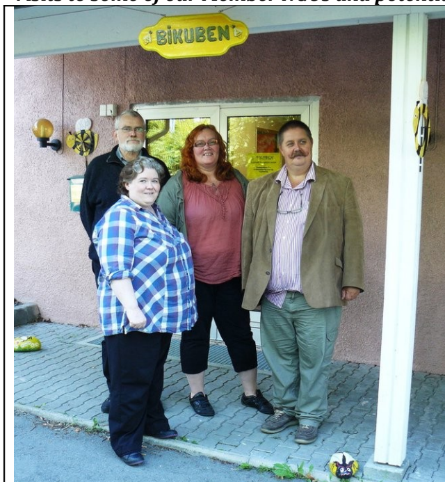
One of our newest member NGOs, Bikuben (A NGO founded by Mental Health, ADHD regions and LPP represented all over North Norway)