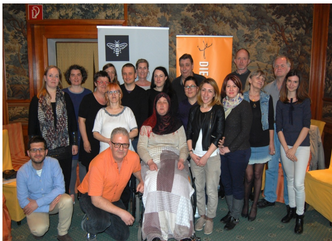
Participants of workshop in March 2017 in Vienna - international participants together with ERSTE-representative and Austrian PEP jury-members

30./31. of March 2017: Exchange Workshop in Vienna with representatives from Austria, Croatia, Hungary, Finland, Iceland, Macedonia, Romania, Serbia and Slovakia.